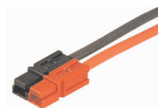
Anderson Power Pole

For the ESC to battery connection a connector is always used so the battery can be removed for charging and storage. Whatever battery or motor connector you decide to use, make sure it's rated for a current/ampage larger than what the motor is likely to pull. If the connector can't handle the flow, it will heat up and potentially be damaged. Also, using connectors not rated for the task will act as a resistor and the motor will never develop full power.