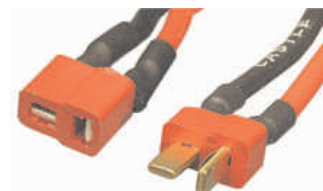
Deans Ultra connector

The common suggestion for battery connections is to personally standardize to a single style of connector. This is done so once an aeromodeller's fleet expands, swapping equipment through different models will be much easier. I like to use Deans Ultra connectors on just about everything except the smallest of planes. There I use Deans micro connectors. That said, Anderson Power Poles work very well all the way up to 60 amp applications and if you use their crimping tool they do not need to be soldered. Their only drawback is that they are physically a little longer than the Deans Ultra connectors. There are others out there too that work well, just decide which ones you like and stick with it.