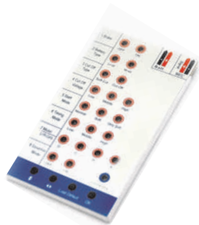
ESC programming card