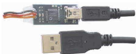
Castle Creations Castle link and USB connector

program changes to other functions of the ESC. Many Speed control makers have also come up with simple programming cards that also allow users to easily program their ESC's.