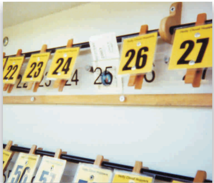
▲ This picture of the frequency board shows the proper placement of a membership card in front of the bar.