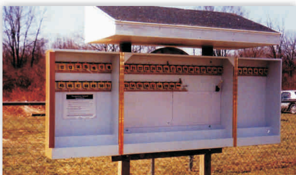
▲ The HCH's take-a-pin frequency control and impound

Some of you may be thinking the issues listed above are minor and have little effect regarding frequency control. Please keep in mind that a lot of thought and research went into the current frequency board. It's designed to provide more information than just what frequencies are being used and who owns it. When conflicting routines develop in the use of a single system, the likelihood of failure vastly increases. Everybody using the frequency board faithfully and exactly the same way is the only way to accomplish the number one goal... Totally eliminating frequency mishaps! †